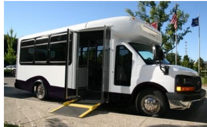
Low-floor Design with ramp

Number of vehicles for Conventional Transit Route = up to 2