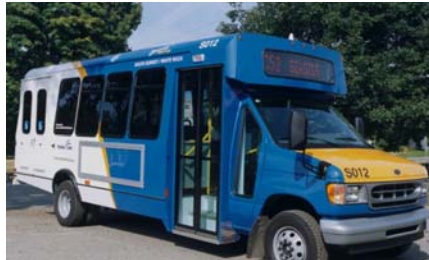
High-floor design with wheelchair lift

To accommodate persons with mobility restrictions, accessibility requirements for the proposed vehicle can be either a low-floor design with a ramp, or a high-floor design with a wheelchair lift. Examples of either vehicle type is illustrated below.