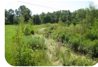
Instream/Riparian Habitat Restoration