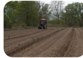
Tree Planting/ Woodland Restoration