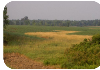
Conservation Farm Practices