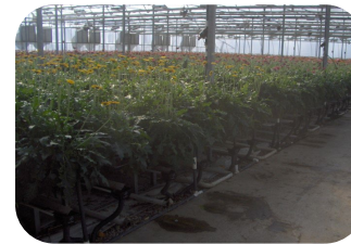
Water Conservation Practices