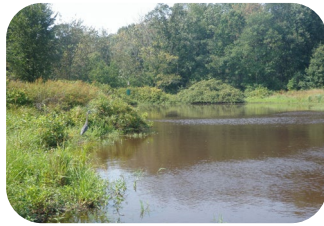
Wetland Habitat Restoration