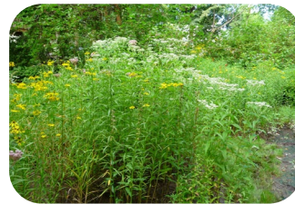
Upland Habitat Restoration