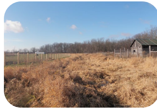
Livestock Restriction & Crossings