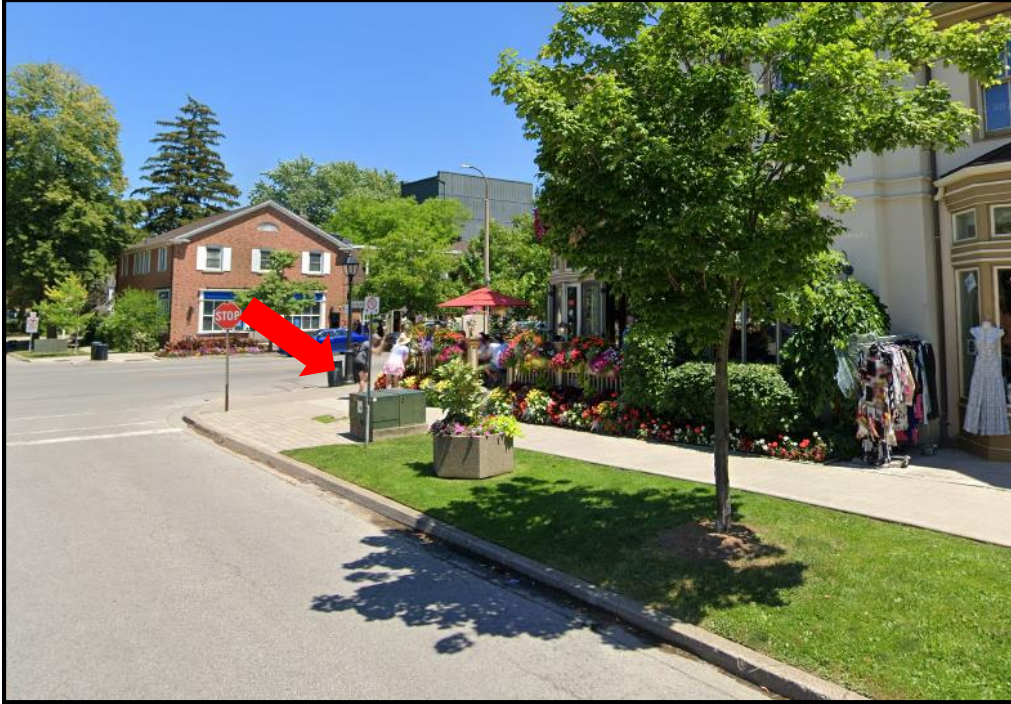
Figure 3: Example of a Hydro Box at the Intersection of Victoria Street and Queen Street