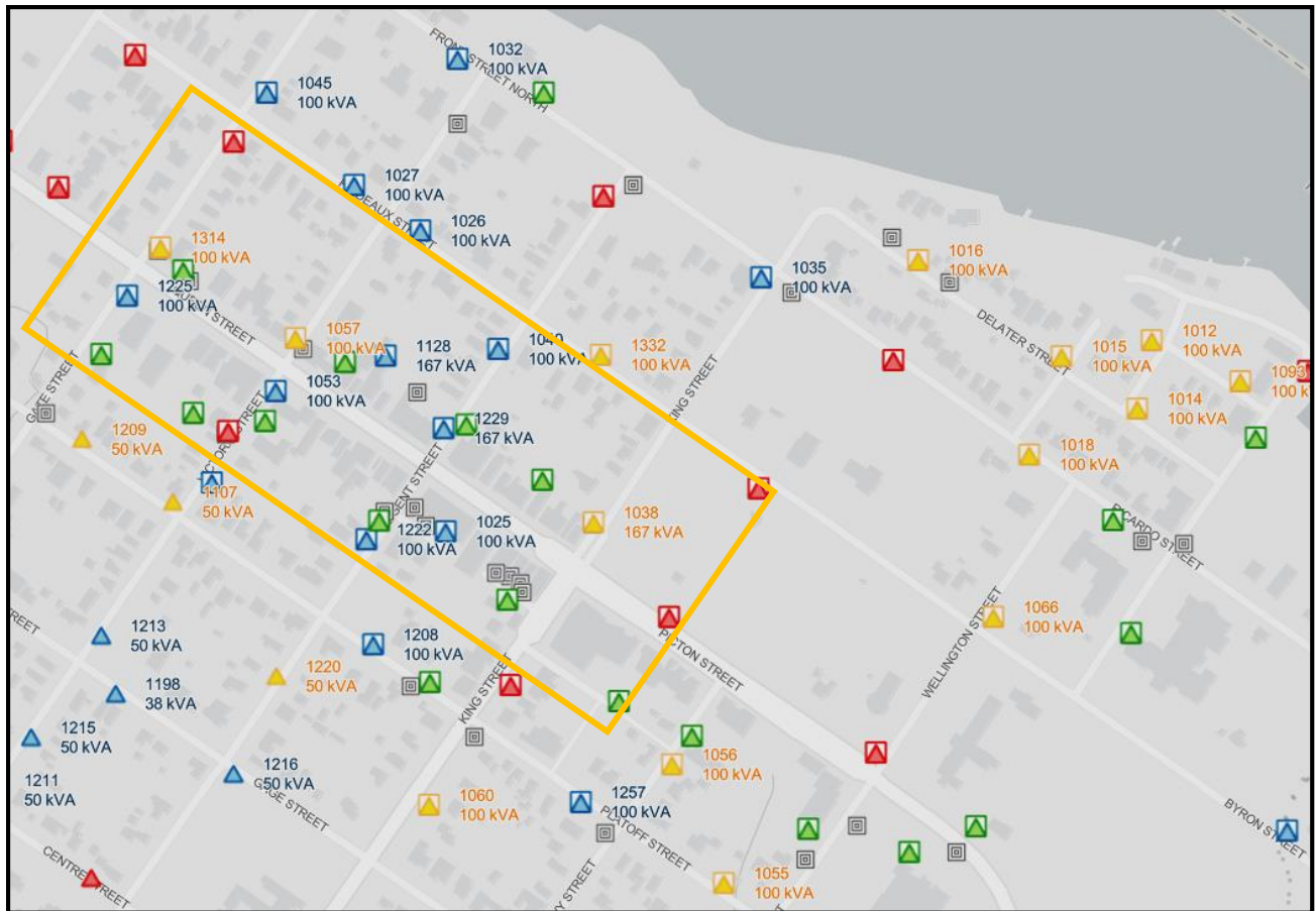
Figure 2: Queen-Picton HCD and Location of Hydro Boxes

The hydro boxes are also small in size and are located on the ground as seen in Figure 3 . They do not interfere with the pedestrian's visual perspectives when walking up and down Queen Street. Therefore, they are not anticipated to disturb or take away prominence from the HCD streetscape.