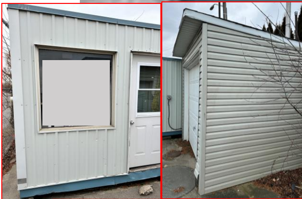
Two Small Sheds – Removal