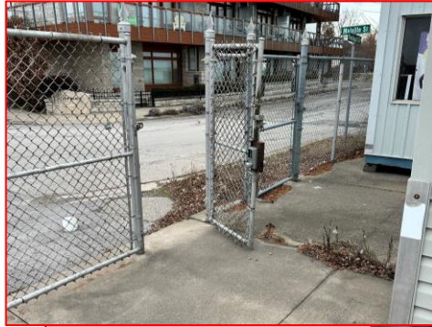
South Fence – Removal