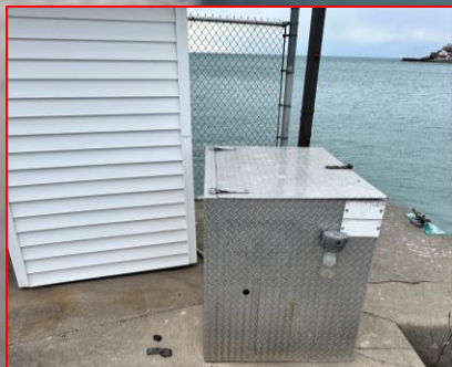
Fuel pump & Filling station #1