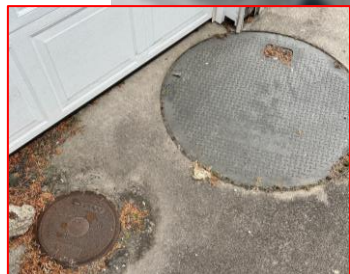
Filling port & Fuel Meter