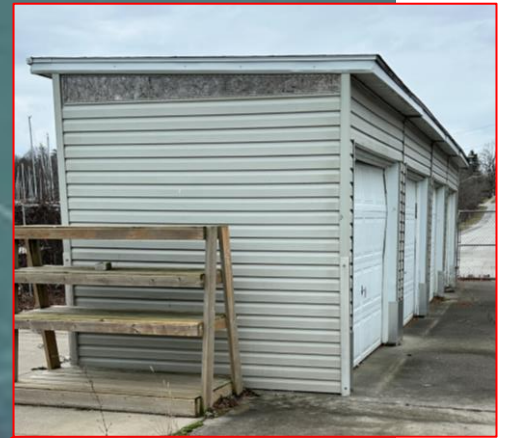
Four Large Sheds – Removal