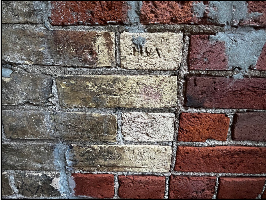
Figure 2: View of Engraved Buff Bricks on South Elevation. Photo by Sumra Zia, August 2023.