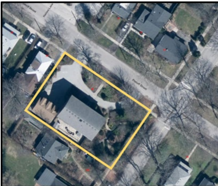
Figure 1 - Subject Property Outlined in Yellow

The surrounding context of 40 Platoff Street is mixed use with commercial use towards the north and residential use towards the south of the subject property ( Figure 1 ). It is also located within the Town of Niagara-on-the-Lake National Historic Site of Canada as a character supporting resource. The subject property is just outside the Queen-Picton Heritage Conservation District (HCD) Plan area.