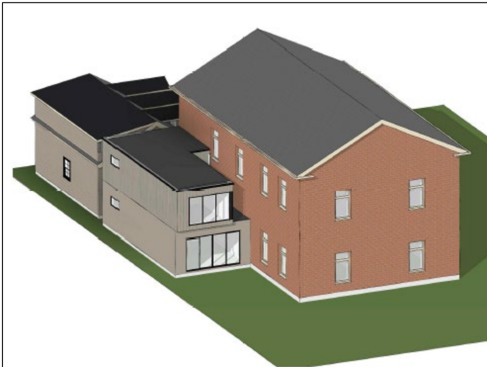
Figure 2 – Proposed 1.5 storey flat roof addition

The development proposal for the 1850s structure includes a two-storey addition on the south elevation. The addition measures 5.2 metres by 11.6 metres. The new structure would partially cover the south elevation. The applicant has provided two design options, one with a 1.5 storey flat roof addition ( Figure 2 ) and one with a two-storey gabled roof ( Figure 3 ).