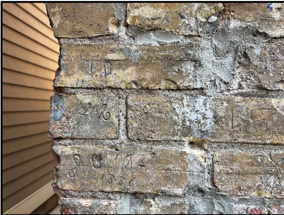
Figure 3: View of Engraved Buff Bricks on South Elevation. Photo by Sumra Zia, August 2023.