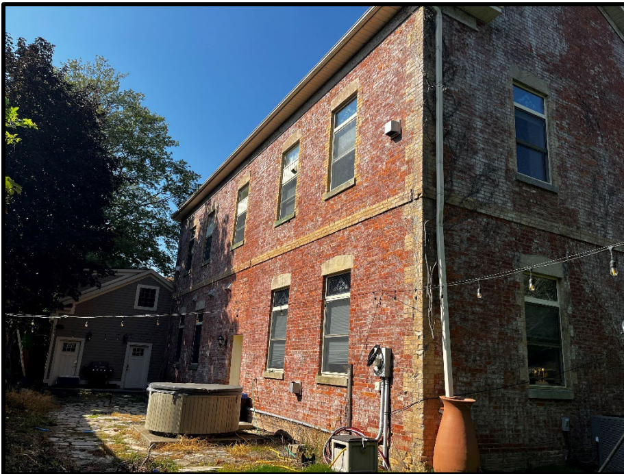
Figure 4: View of South Elevation and the Existing Heritage Attributes. Photo by Sumra Zia, August 2023.

The proposed addition would partially cover the south elevation, thereby covering the window openings, buff brick quoins on southwest corner, and the buff brick stringcourse running through the elevations (see Figure 4 ). The addition would not be visible from the Platoff Street as it is located behind the former school building. From Davy Street mature trees and foliage currently obstruct views to the south elevation.