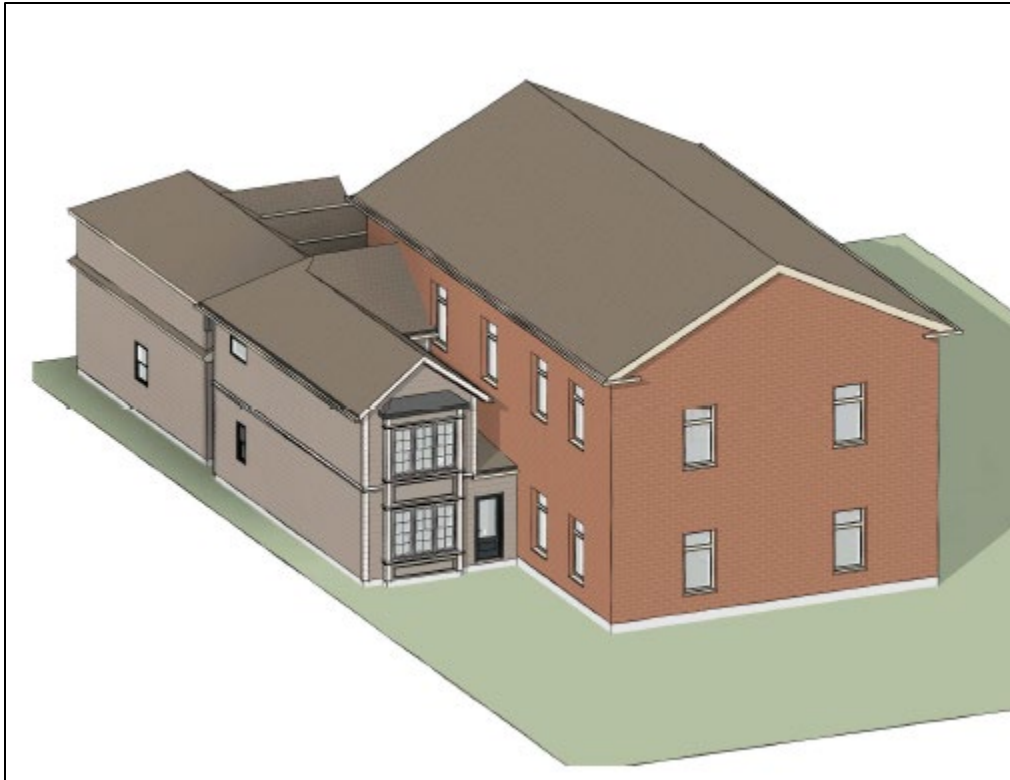
Figure 3 – Proposed two-storey gable-roof addition

In general, the addition is largely reversible and the construction methodology being used would not substantially negatively impact the existing former school structure. Rather than attaching the proposed addition to the house by means of rebar through the brick, the roof and wall connections are proposed to be adhered to the existing brick building using a reversible adhesive which is suited to use on brick. The addition is proposed to be lower in height than the 1850s structure. The design of the proposal is in contrast to the historic structure. Sympathetic design is proposed through the neutral shades of horizontal siding as exterior cladding, similar gabled roofline and pitch as the existing structure and the proposed fenestrations compliment the historic building.