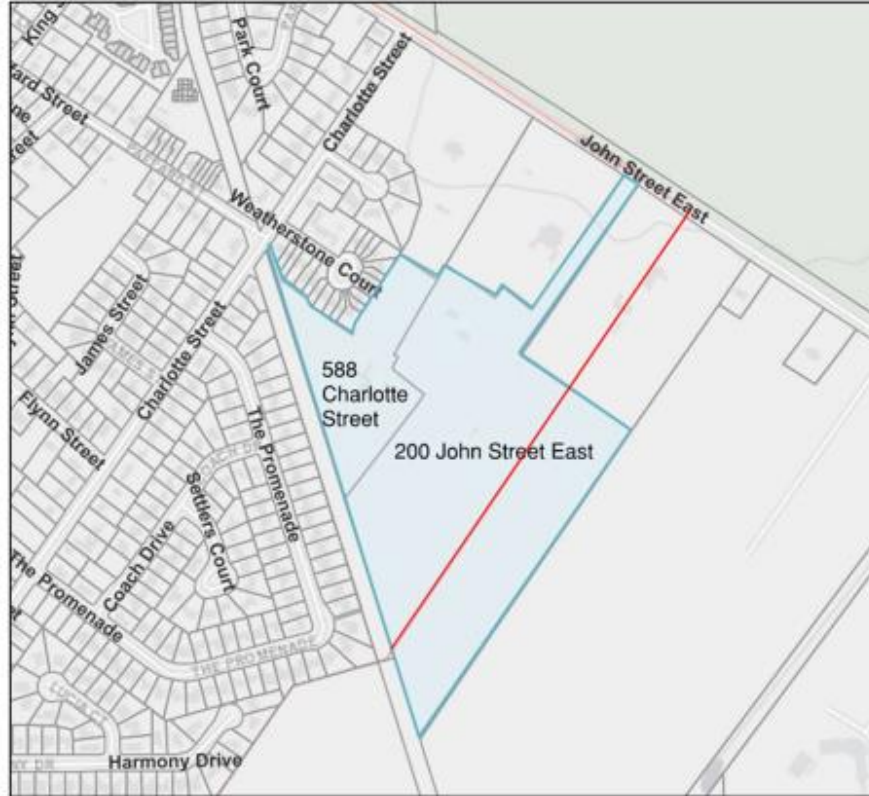
Figure 1 - Location Map, Subject Properties shown in blue, Urban Area Boundary shown as red line.