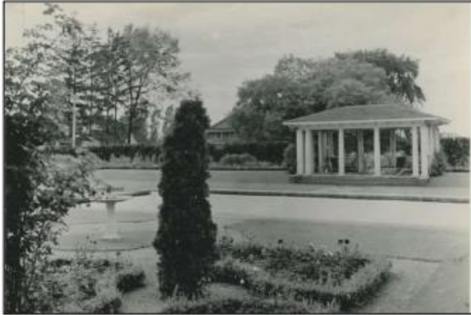
Figure 7. Swimming Pool Garden, date unknown.