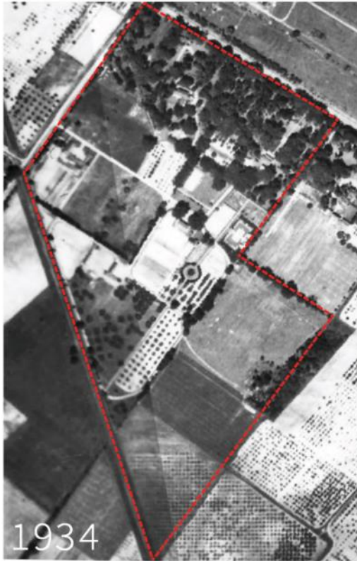
32. Aerial photo of the Estate in 1934

The following aerial photographs show the evolution of the Rand Estate within each of its four major eras of development.