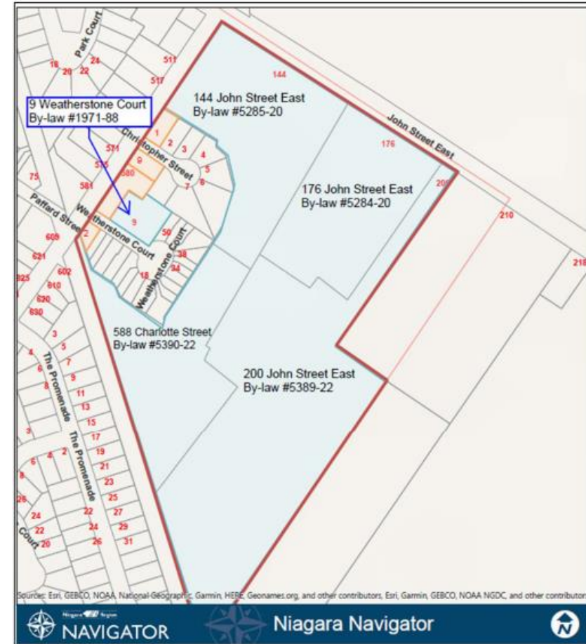
Figure 2 - Former Rand Estate outlined in red, properties with Designation By-laws shown in Blue, properties listed on the Town's Municipal Register of Properties of Cultural Heritage Value or Interest shown in orange.