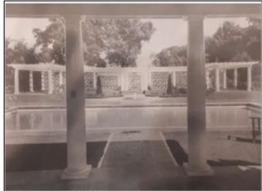
Figure 8. Swimming Pool Garden in 1930 with original pergola in background.