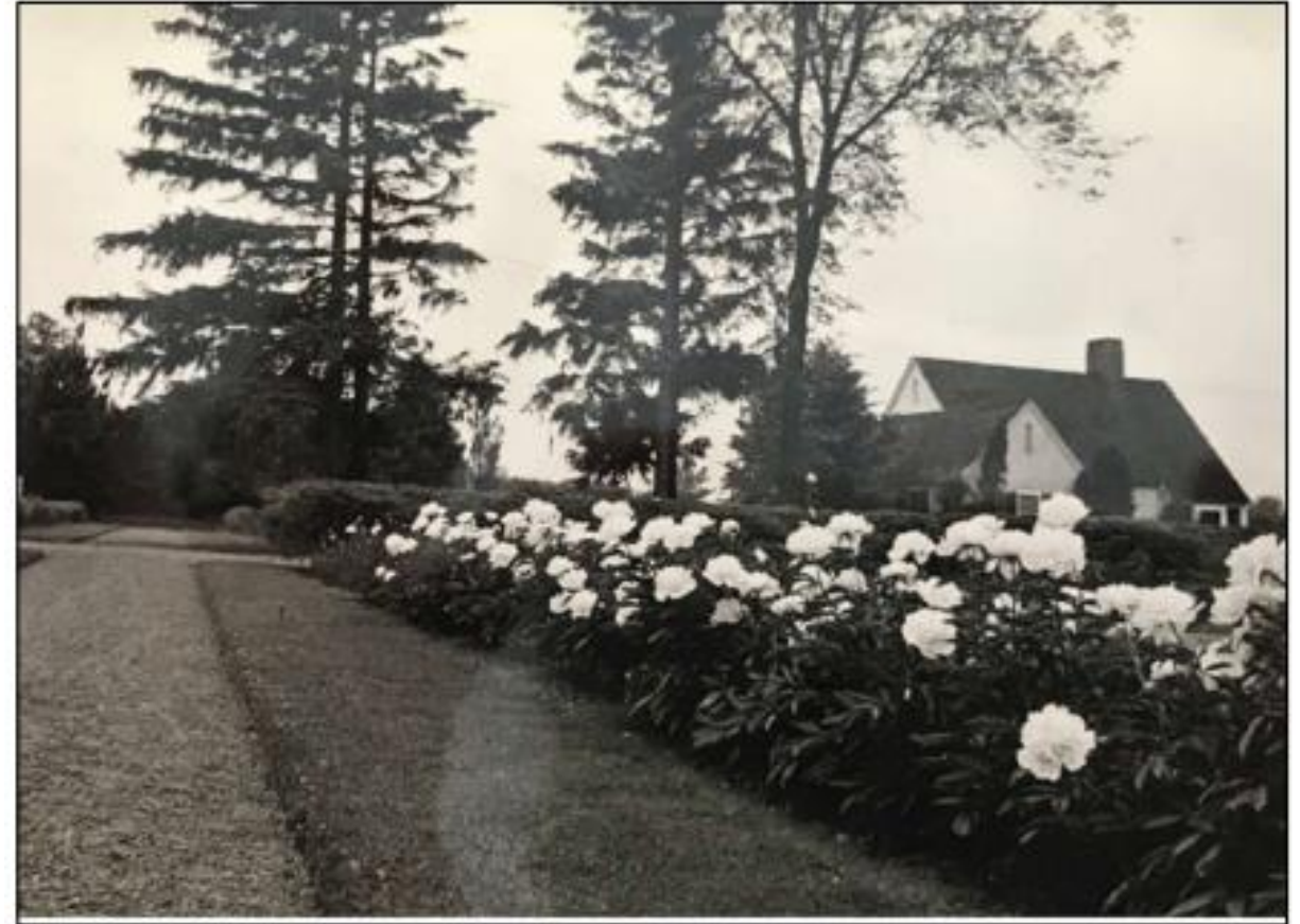
Figure 15 - 200 John Street East Peony Garden adjacent to Swimming Pool Garden, Calvin Rand Summer House visible in background.