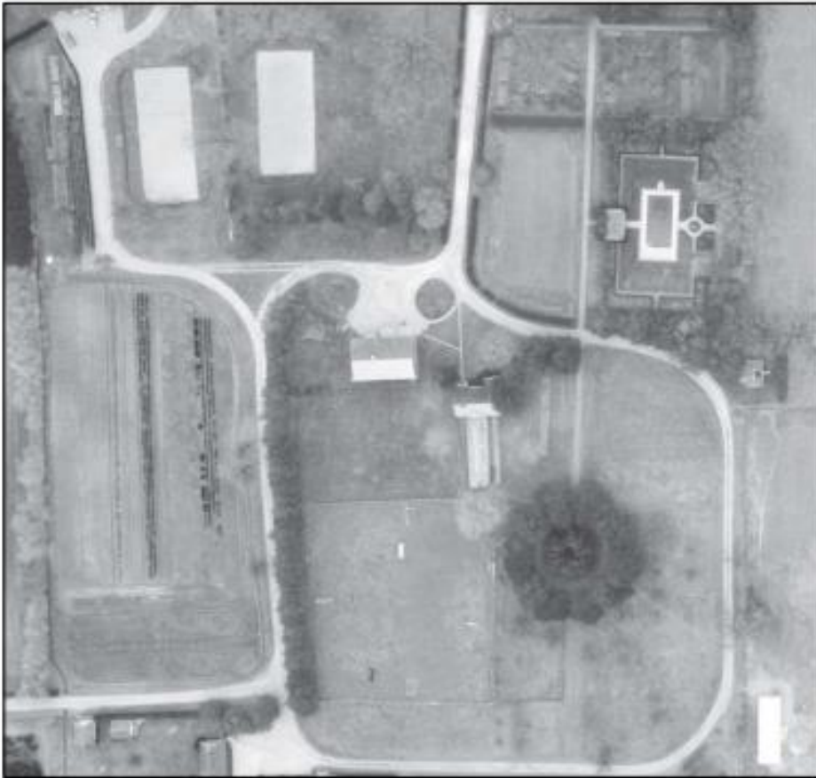
Figure 16 - 1971 Aerial Image showing the Swimming Pool Garden at top right, Axial Walkway (Main Walk) just left of the Swimming Pool Garden and moving south through the Mound Garden.