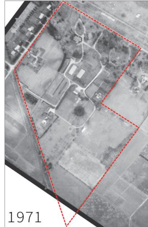
34. Aerial photo of the estate in 1971