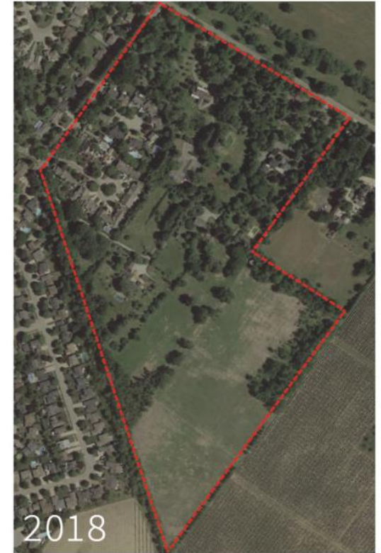
35. Aerial photo of the estate in 2018, prior to the landscape removals and alterations (Source: Google/ERA).