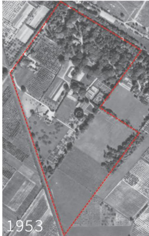
33. Aerial photo of the estate in 1953